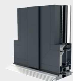
DOUBLE DOOR MEETING STYLE & LOW THRESHOLD