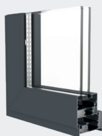
WINDOW SASH CORNER